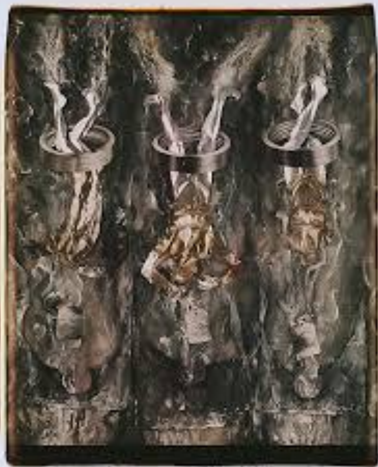
Plate 104. Empidonax griseus X IX. Same locality 1935.