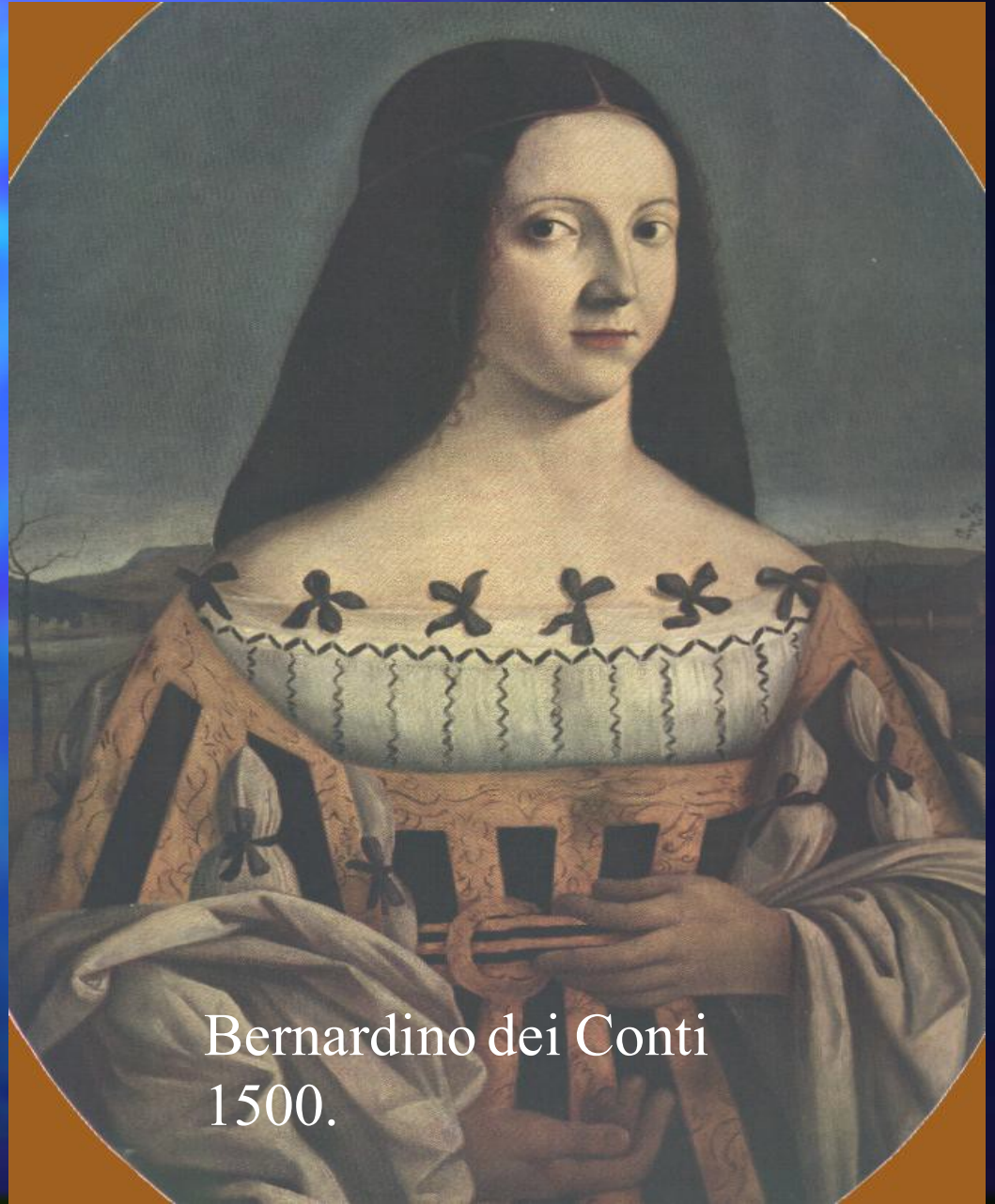
Bernardino dei Conti 1500.